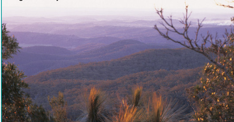
View from Bunya Mountains.

Identification and management of regional landscape areas is necessary to ensure the natural and cultural values of our regional landscapes is preserved.